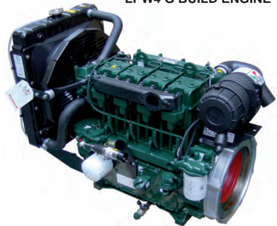
LPW4 G BUILD ENGINE